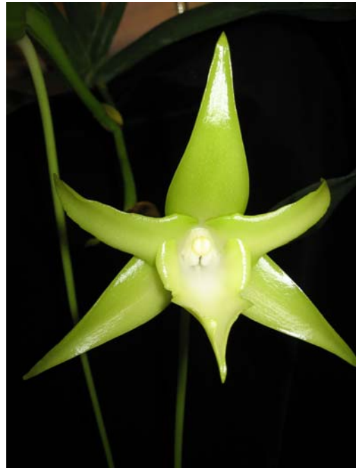
December 18, 2006