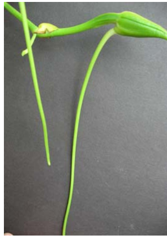
December 12, 2006