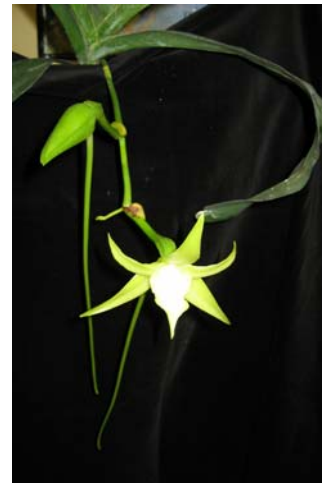
December 18, 2006