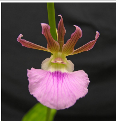
Eulophia guineensis 'Bryon'

Since there will be some wonderful plants available to purchase at the Winfield greenhouses, there will be no plants raffle this month.