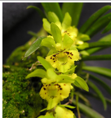
Chytroglossa aurata 'Bryon'